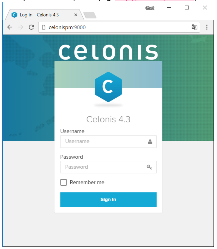
Figure 7: Celonis web frontend

• "http://<hostname of your server>:<port>" (e.g. http://celonispm:9000)